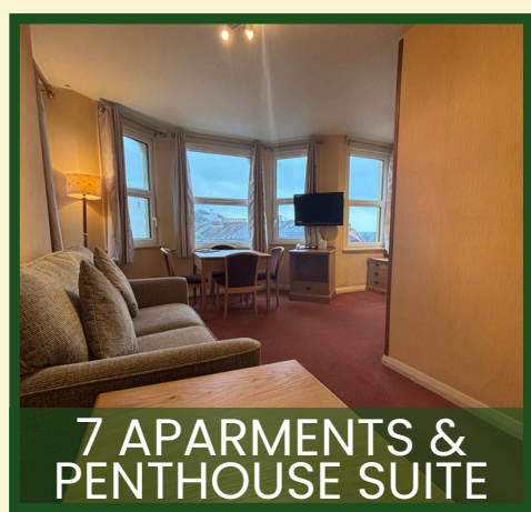
7 APARTMENTS & PENTHOUSE SUITE