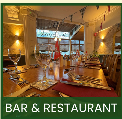
BAR & RESTAURANT

Built in 1896, with expansion over 3 buildings